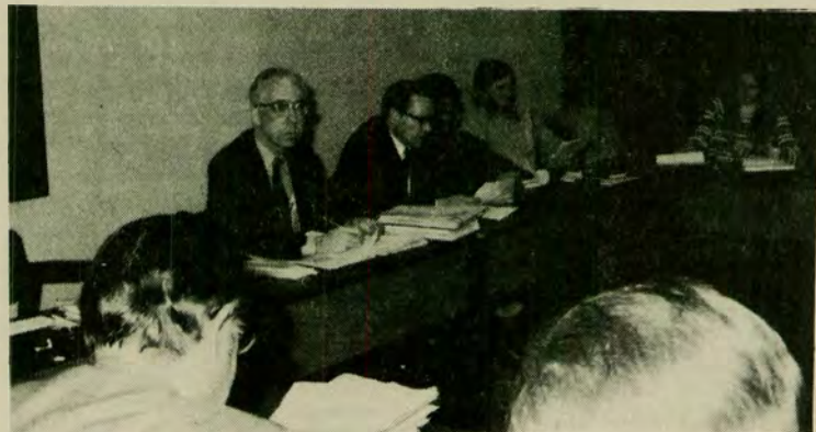
The Student Life Council in action