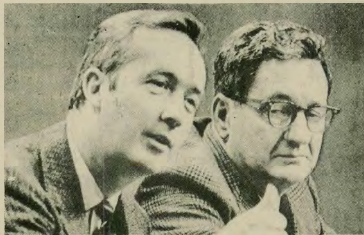
Space officials said yesterday they had "every intention" of allowing the Apollo 14 astronauts to try a landing on the moon Friday morning.

Further complicating the problem is the fact that when the astronauts inspected the probe-like device they could find nothing wrong with it.