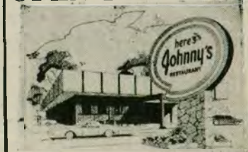
Corner of Edison and Ironwood.