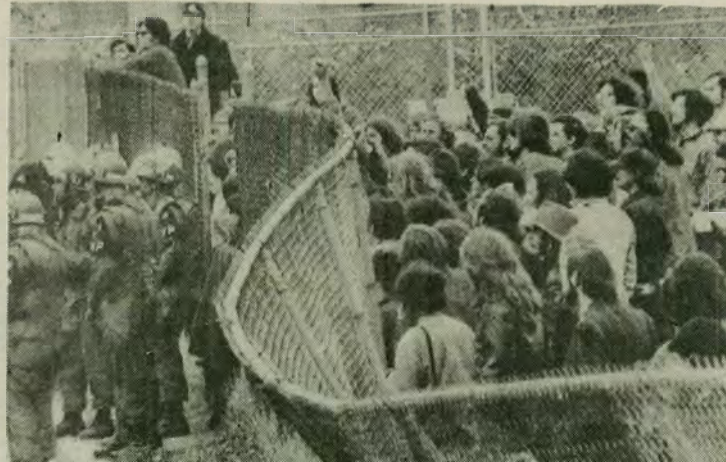
WASHINGTON: Antiwar demonstrators try to push down a fence behind which they were corralled on a practice field alongside RFK Stadium yesterday.