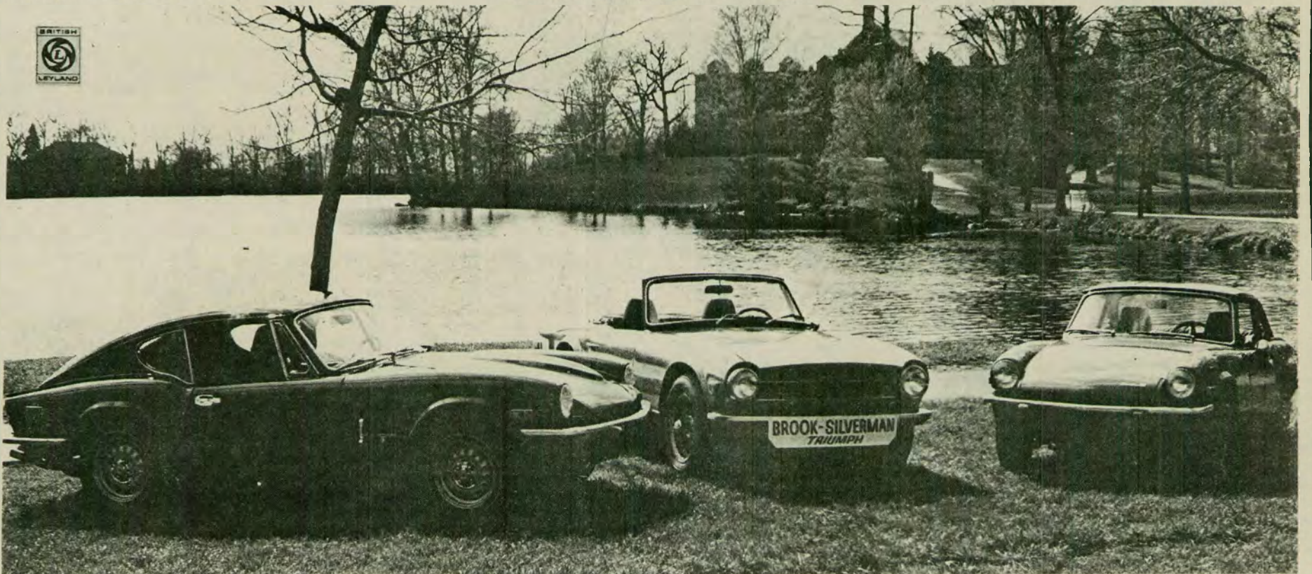
GT-6 Mark III