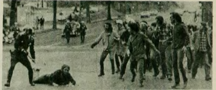
WASHINGTON: Antiwar demonstrators scatter at 23rd Street and Constitution Ave. yesterday as police use chemical spray.

In some cases, demonstrators threw big tree stumps, rocks, broken glass and nails on roads to try to halt traffic.