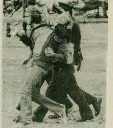
Two demonstrators arrested in Washington.  legal as soon as the couple obtained a license.

Linda's outfit featured a knee length Navy pea jacket and bowling shoes. Lyons wore a pink sweatshirt and blue jeans.