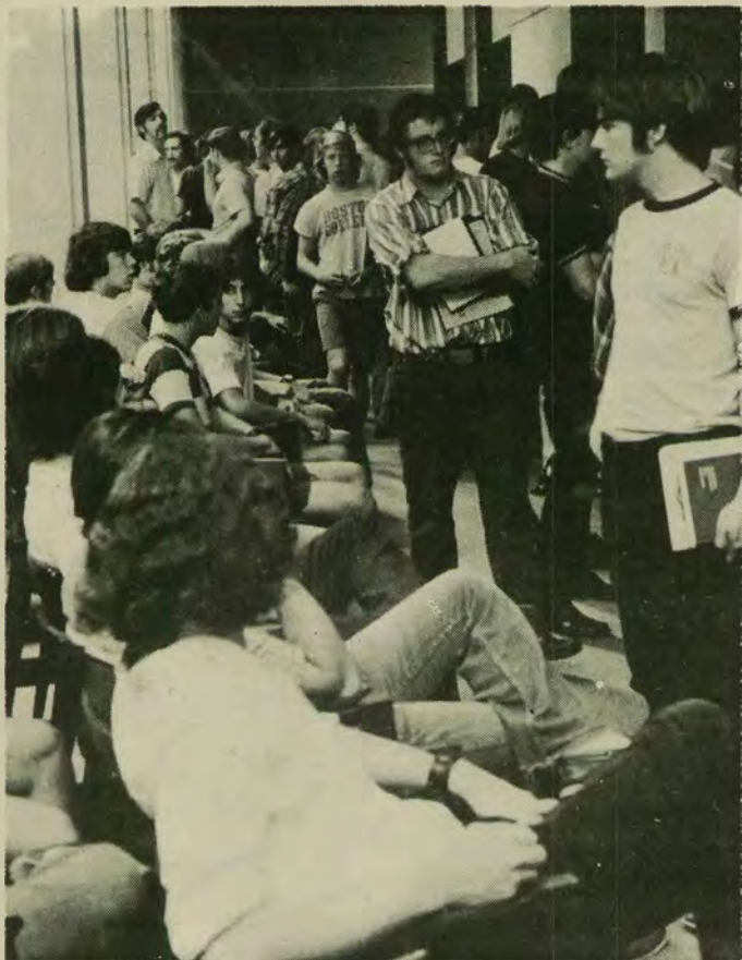
Crowds in the Center for Continuing Education before yesterday's SLC meeting was moved to the Engineering Auditorium.