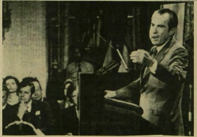
President Nixon announces another presidential trip.