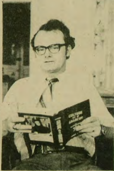
He hopes "to bring a new perspective to campus life."