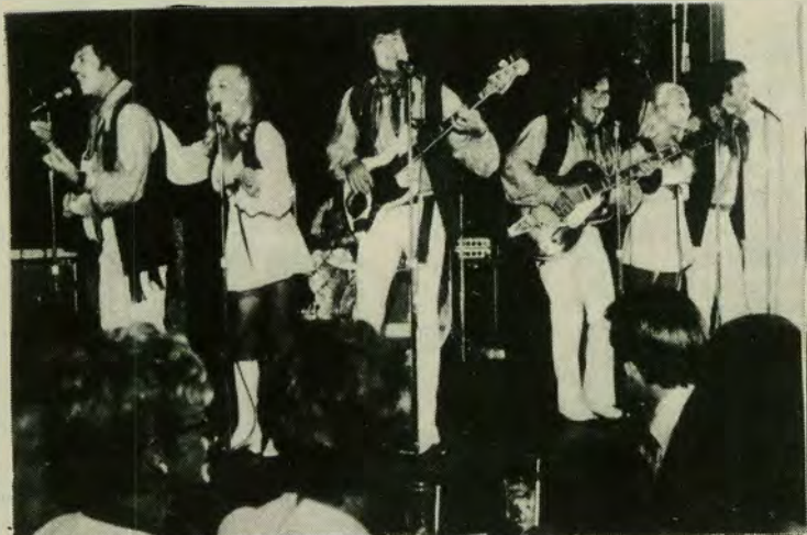
Budweiser brings the Burgundy Singers free to ND tonight at O'Laughlin

Then late in 1967, one of the group saw an article in the school paper inviting any interested musical organization to complete in the National Intercollegiate Jazz Festival. The first step would be the Regional contest in