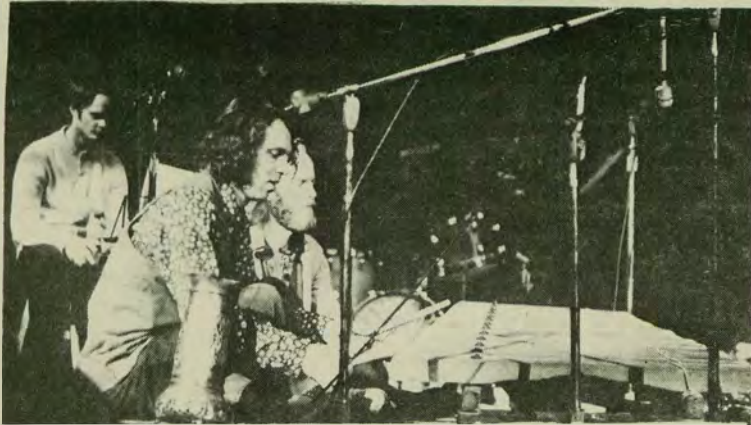
Winter Consort performed opposite Richie Havens at the Mardi Gras concert.