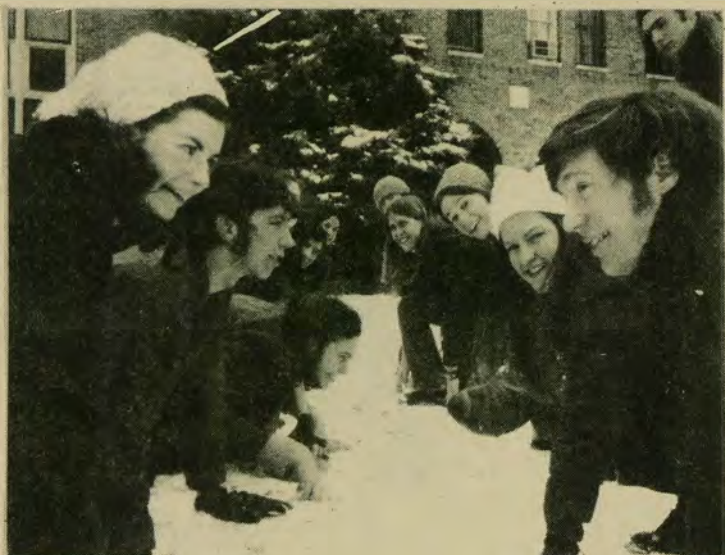
At the snowy line of scrimmage are a few of the people who enjoyed the Winter Festival this weekend.