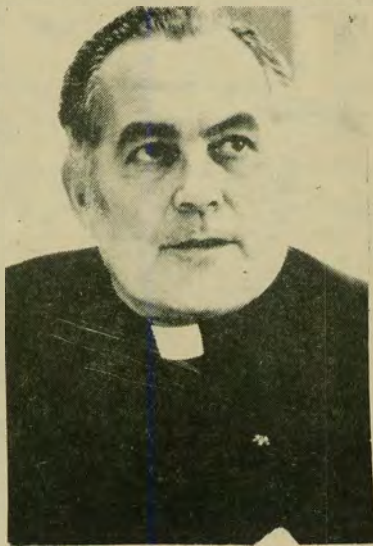
Hesburgh announces new minority aid.

It might be satisfactory for minority students if the University established a graduated program of endowments so that the endowments would approach the $6 million mark according to