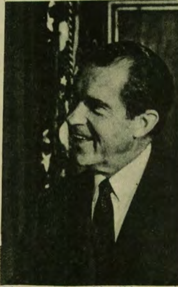
Nixon meets with Chinese officials.

Chou said the reasons for 20 years of tension without contacts were "known to all"--meaning primarily American support for an independent Taiwan. He credited both governments for "common efforts" to open the gate to better contacts at last. And he expressed confidence that further pressure from the people--who "alone" shape world history--will surely bring the day when China and the United States