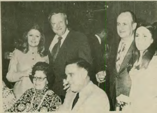
SMC parents express an attitude of disappointment over merger affairs.

Not only did parents lament their uninformed position, but complained that they consequently could not help guide their daughters in deciding what