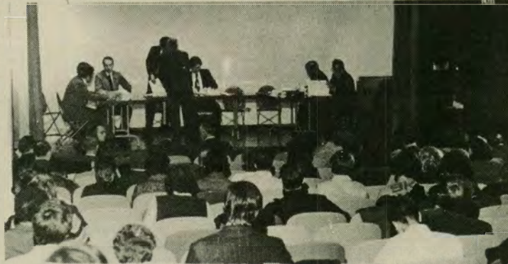
The fate of South Bend - Chicago train is being reviewed at a public hearing.

Persons from all walks of life testified at the hearing; commuters to Chicago and Gary, college students, businessmen and homemakers. The hearing is a result of an application of the Chicago South Shore and South Bend Railroad to the ICC for permission to discontinue 37 passenger trains, as well as changes of schedules of certain other trains. The ICC must rule on the application by May 31, 1972.