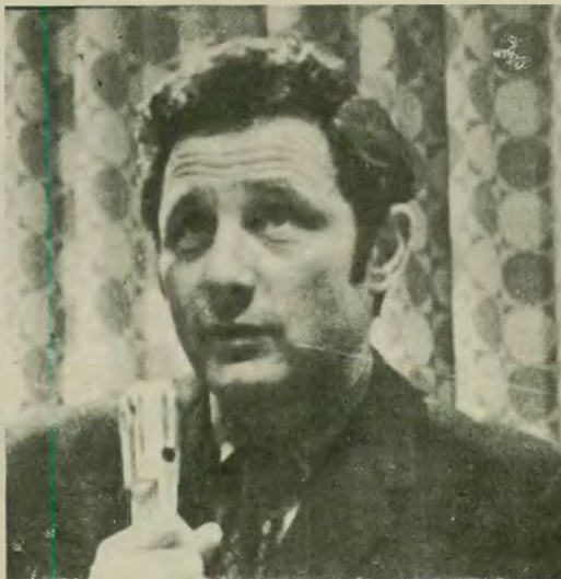
Sen. Birch Bayh on busing: quality education not supplied by magic racial ratio.

He did express approval of the present draft deferments. "Too often college exemptions