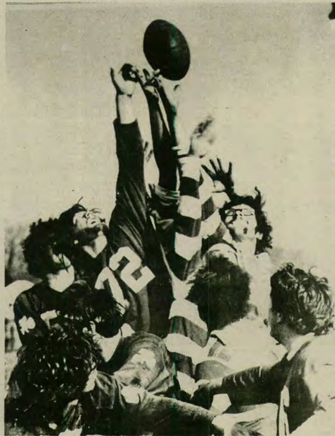
Victory, like this ball, was within reach of the Notre Dame ruggers last weekend but was snatched away by the John Carroll club.

In the second half John Carroll opened the scoring with a try, upping its lead to 7-0. The conversion attempt failed.