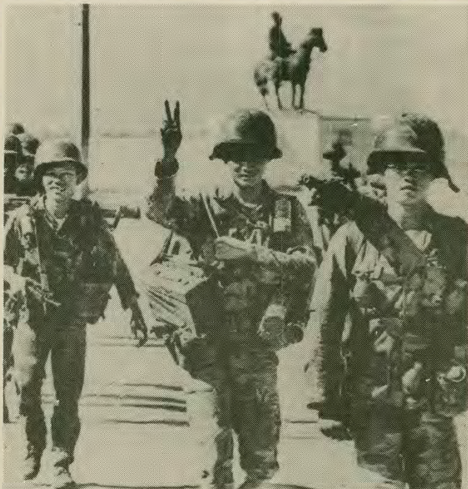
Singapore and Thailand.

Last year the U.S. had a trade deficit of some $3.5 billion with Japan, $450 million with Hong Kong, $300 million with Taiwan and $300 million with Malaysia, far outweighing its favorable balance of trade with