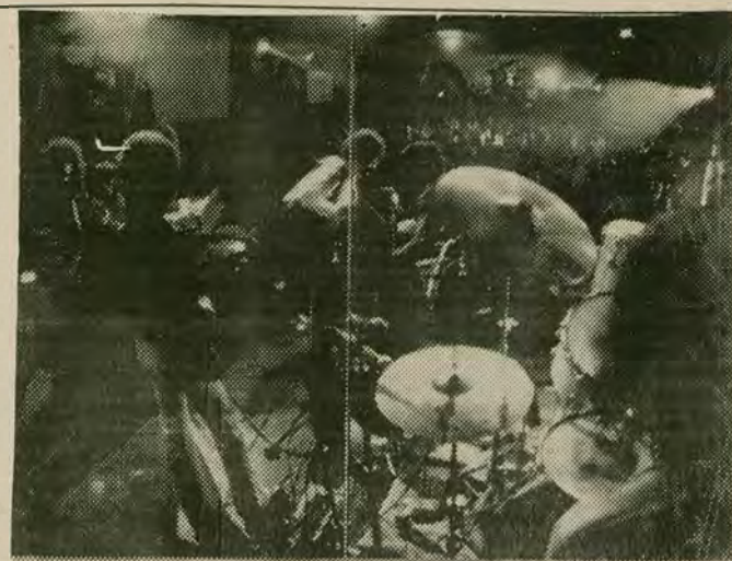
a Mardi Gras Concert with