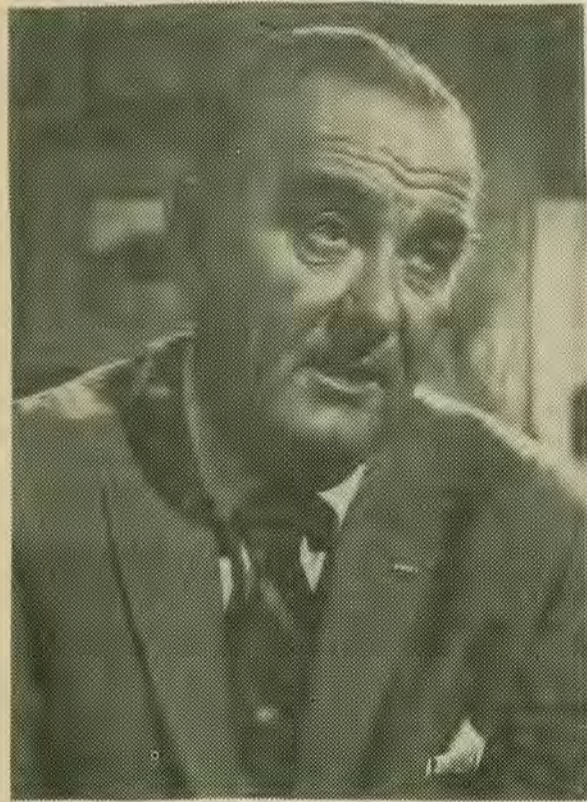
Lyndon Baines Johnson: 36th President of the United States, 1908 - 1973.

Ironically, Johnson died in what appeared to be the waning days of the war that had transformed him from the man who had in 1964, won election to a full term as president with the greatest voting majority ever accorded a candidate, to the president of a divided nation.