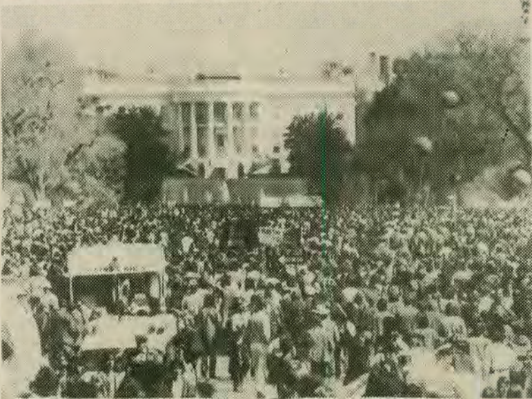
Demonstrators for many causes beset the Johnson-occupied White House.