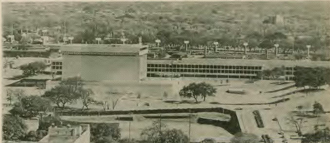
The Lyndon Baines Johnson Memorial Library, situated on the campus of the University of Texas.

But it is the American people who will remember this legendary figure, this very tall Texan.