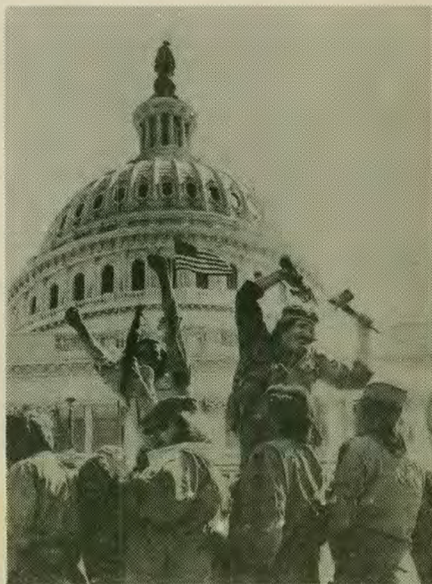
Washington was the scene of many antiwar demonstrations during the Johnson administration.

The former President appeared thin, but he appeared to be enjoying the opportunity to see old friends and shake hands with well-wishers who flocked around him.