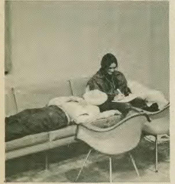
The reaction of this gentleman typifies the sentiments of some students when confronted with student body elections.

Ballot boxes will be in every residence hall from 11:00 a.m. to 1:00 p.m. and from 5:00 p.m. to 7:00 p.m. In between those hours the boxes are to be returned to the Student Government office.