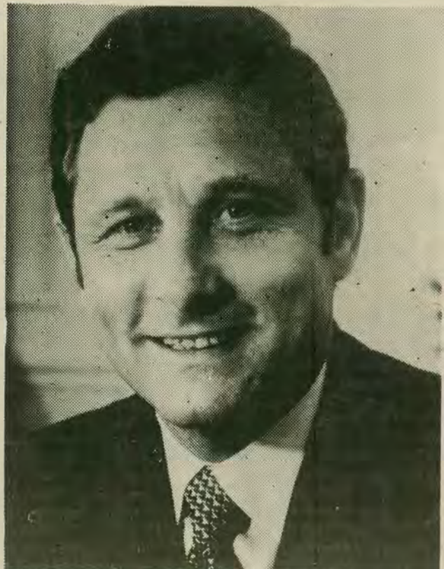
U. S. Senator Birch Bayh (D-Ind.) who led the successful effort in the Senate to lower the voting age to eighteen will speak at the Library Auditorium at 8p.m. tonight.