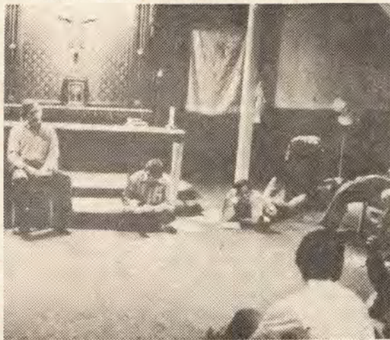
The Hall Presidents Council discusses pros and cons of three constitutional proposals during last night's meeting

The Student Association Chairman would: (1) serve as chief executive officer and official spokesman for the Student Association Forum; (2) serve as chairman