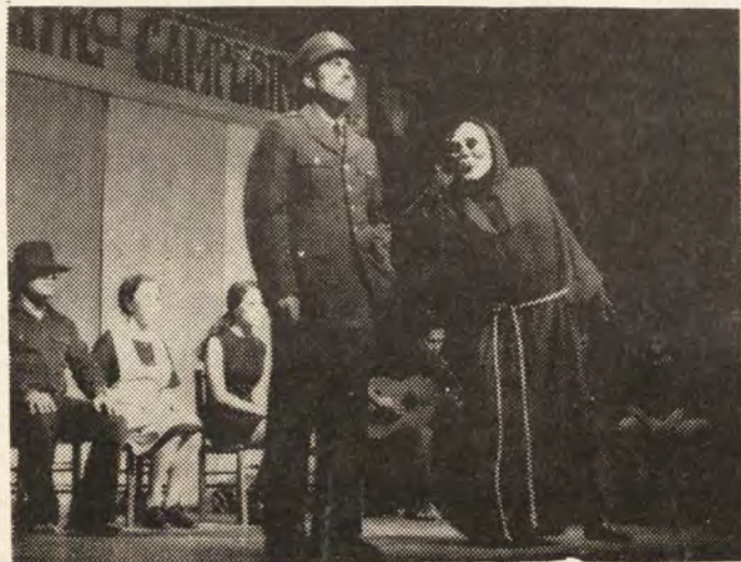
El Teatro Campesino tells the story of the farmworker in various actos.

El Teatro Campesino has received the Los Angeles Drama Critics Award (1970 and 1971) and the Obie Award (New York, 1968.) El Teatro has also been the model for the Teatro Urbano (City Theatre) and the Teatro Chicano (theatre workshop for teatro groups.)