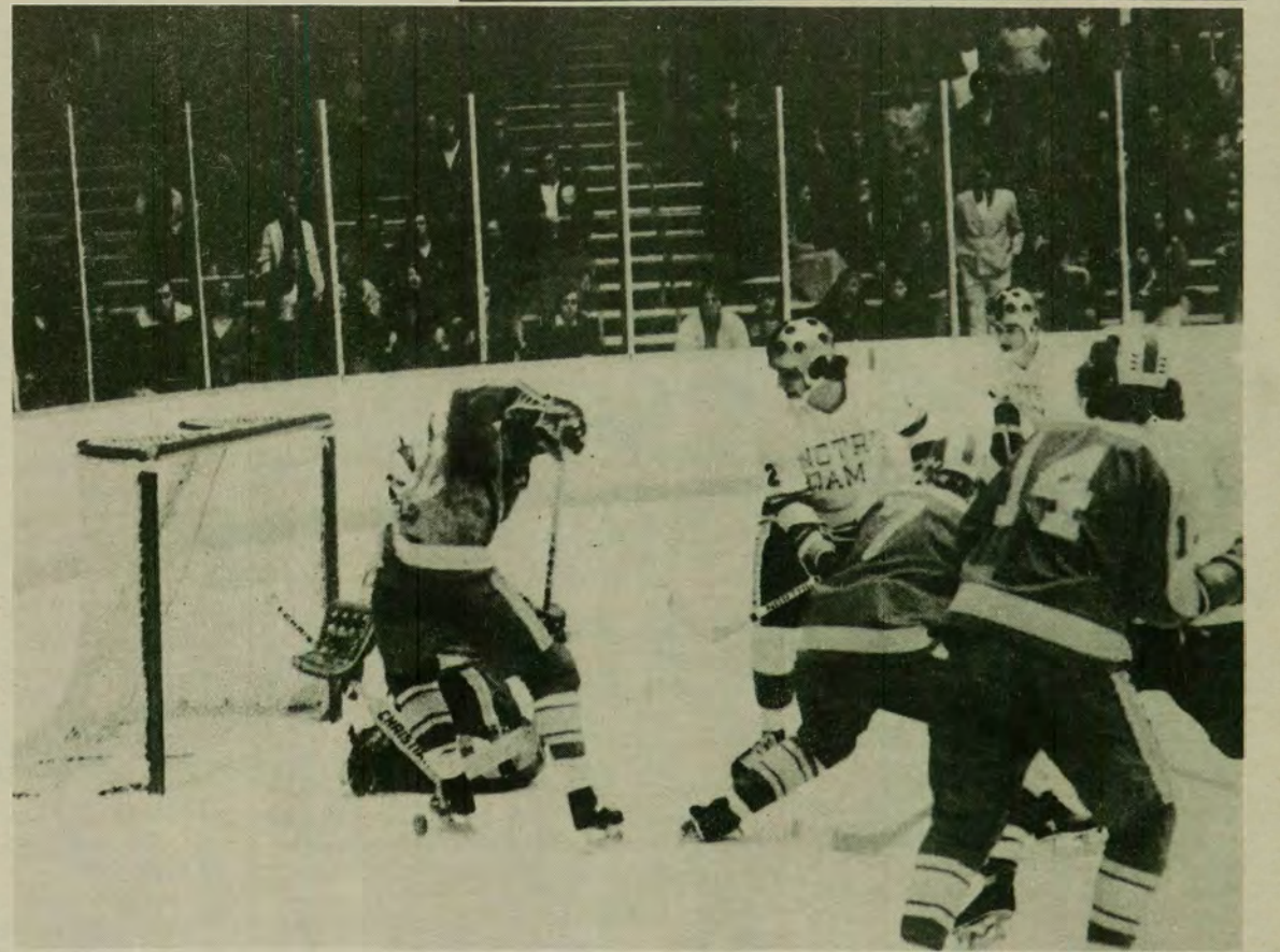
Notre Dame's ice hockey team ended a string of setbacks on Sunday afternoon, with a 4-3 OT win over Denver.