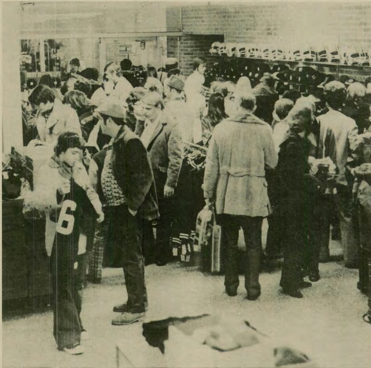
Another season of bookstore buying ends with a 10-0 record.