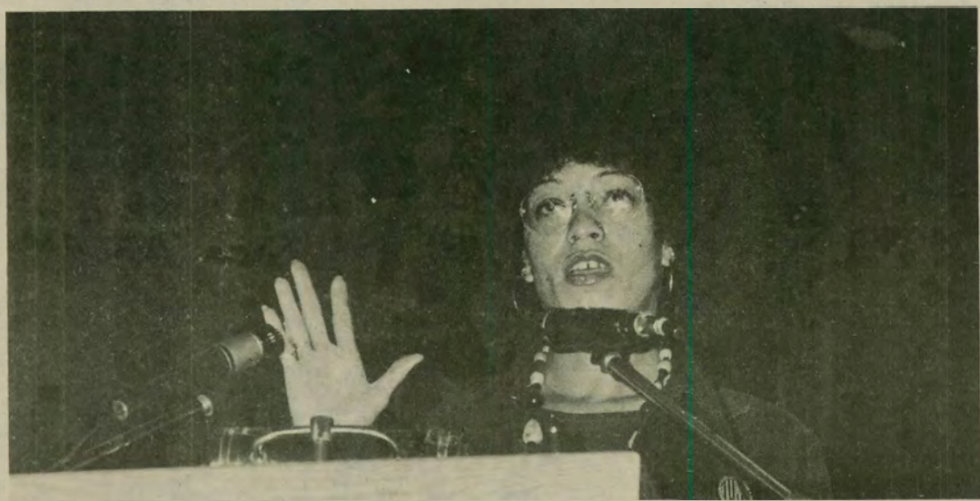
Angela Davis: 'I am not afraid to say that I think Rockefeller ordered those state police and those prison guards to go in with submachine guns.'