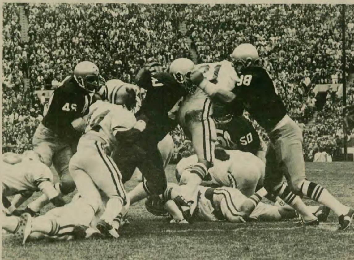
The defense outshone the offense Saturday afternoon. The Irish "D" allowed Rice only 149 yards total offense, and only 45 in the second half in the 10-3 ND victory.