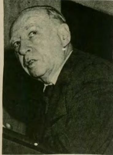
Dr. Hans Morgenthau

"Even if the U.S. could come to terms with this problem we would still be faced with the overriding issue of nuclear power," stated Morgenthau. "We are talking of