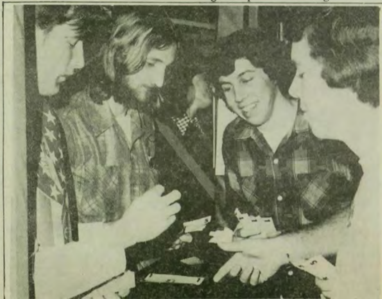
There's a sucker born every minute - and two to take him." - P.T. Barnum.