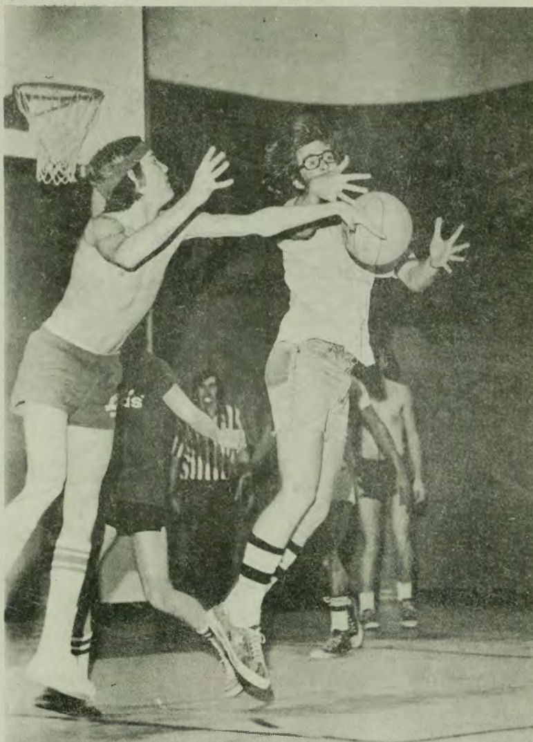
The dominant teams are starting to emerge as Interhall Basketball play continues.