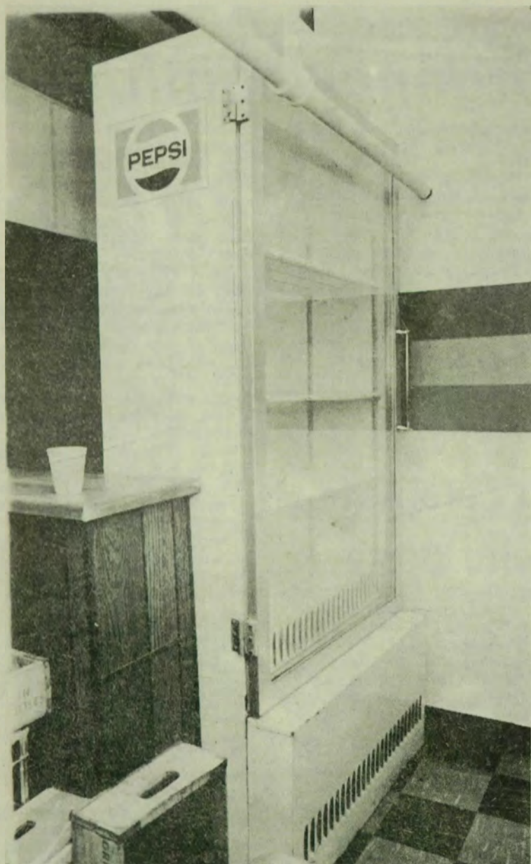
Thieves cleared sandwiches and soft drinks out of this refrigerator in the basement of Fisher sometime between 4 a.m. and 6 a.m. yesterday morning.