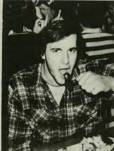
This is MY kind of place!

should include two or more glasses of milk. Cheese, ice cream and other milk foods can supply a portion of this daily requirement.