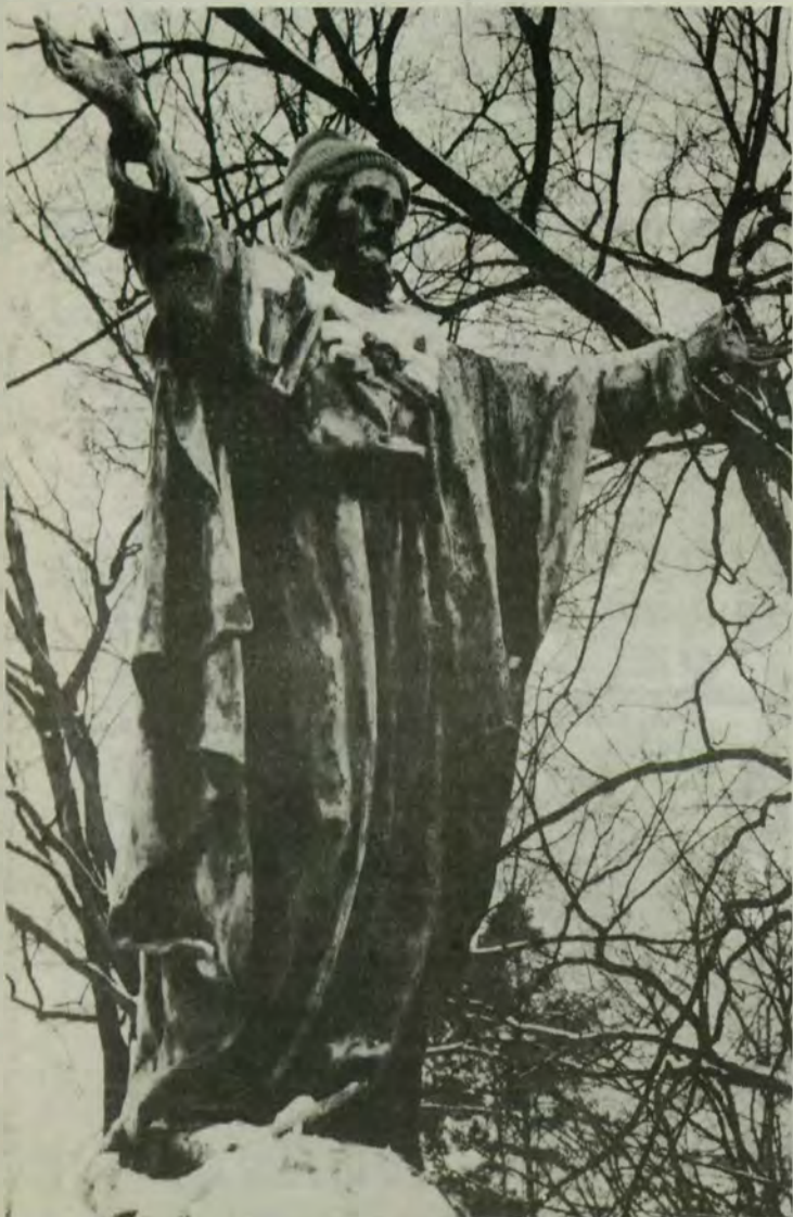
"It never got this cold in Israel!"

Faculty Senate meetings are open to interested parties.