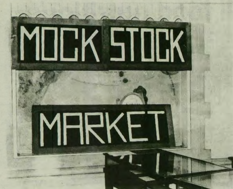
Where can you get $10,000 for $1? Only at the Mock Stock Market in the lobby of Hurley Business Building.

Thursday, the troupe will lead the ND-SMC Theatre in mime technique class on the Notre Dame campus.