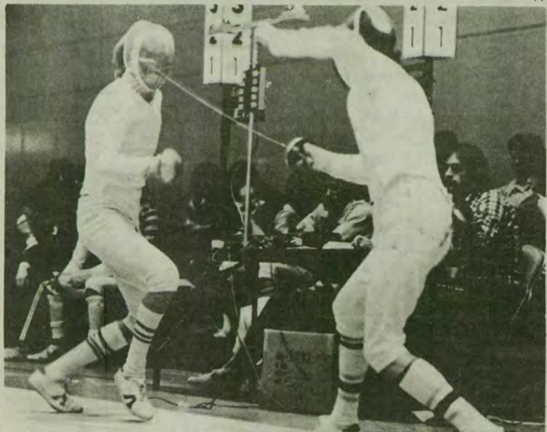
The unbeaten ND fencers face a rematch with Wayne State in a quadrangular meet at Tri-State College this weekend.

Notre Dame will remain on the road for the next two weeks and will not return home until February 28 when they will face Big Ten opponents, Illinois and Wisconsin.