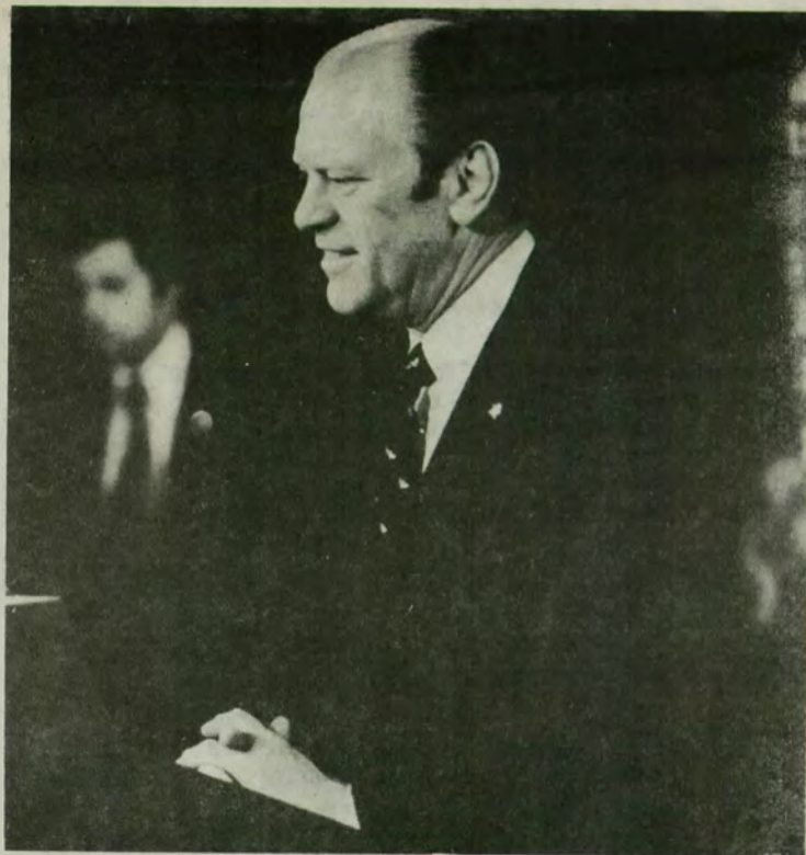
President Ford took a "moderate position" yesterday stating that he did not agree with the Supreme Court's decision legalizing abortion.