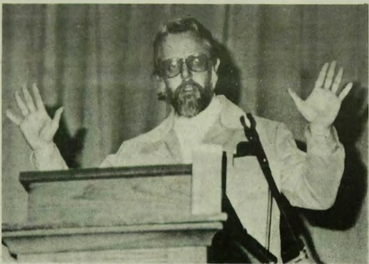
Harvey Cox, speaking in the first of the American Radicalism lectures.

Protestant evangelism has also produced some radical critiques of American society.