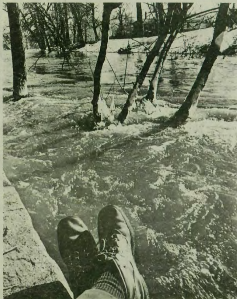
South Bend's historic Leeper Park still shows traces of snow. Will Spring never come?