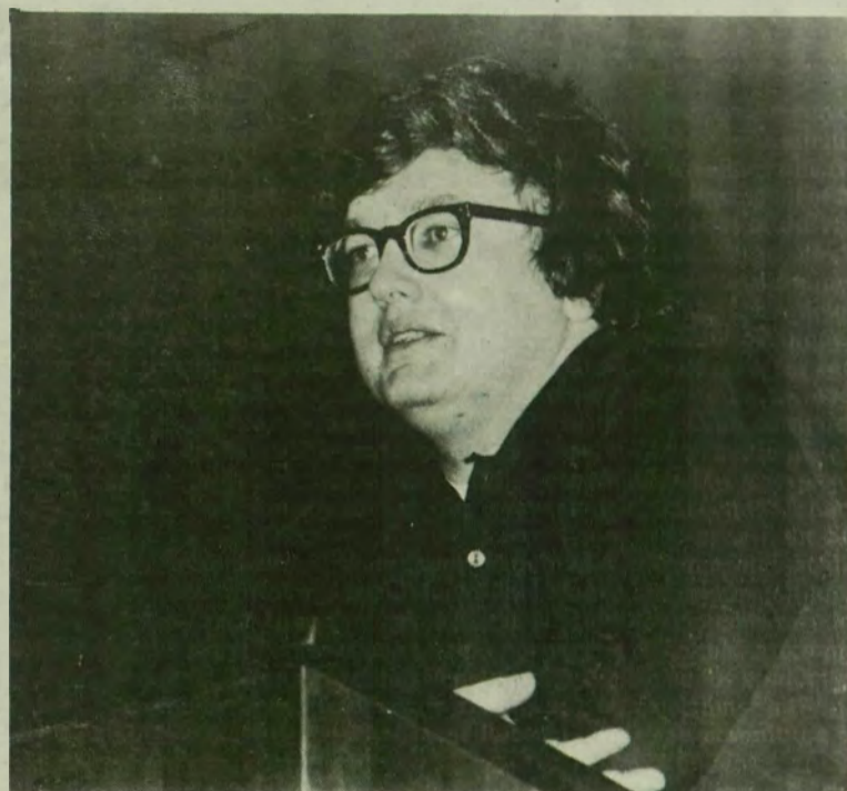
Film critic Roger Ebert.

Ebert also expanded on the lack of females in the movie-making business. "I don't know why we don't see better roles for women," he said. "The studios are all run by men and they just won't risk the money."