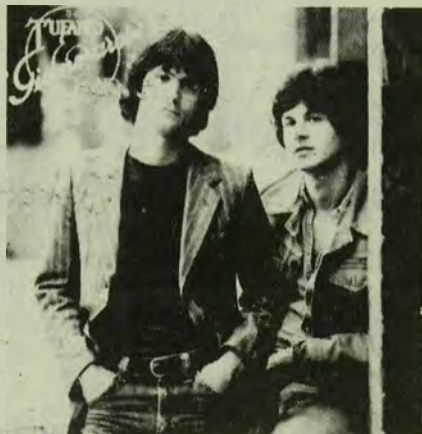
love song with lyrics like:

"Gone like the Wind" is the antithesis of "heartbreak". It is a regular old-fashioned