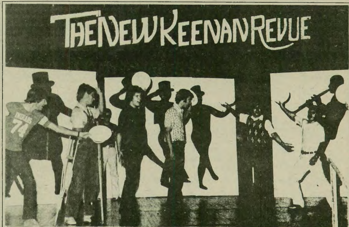
The New Keenan Revue, staged last Saturday night in Washington Hall, proved to be a huge success. The show offered "a little bit of

SPDR 425, Advanced Classical Ballet is advanced ballet theory and technique. SPDR 490 Drama Criticism and Theory examines selected readings from major dramatic theorists and critics. SPDR 491, Small Group Interactions examines major theories and research findings relating to communication in small group situations supplemented with group interaction activities. SPDR 494, Theater for Young People is a comprehensive study of informal and formal theater for youth from pre-school through secondary school.