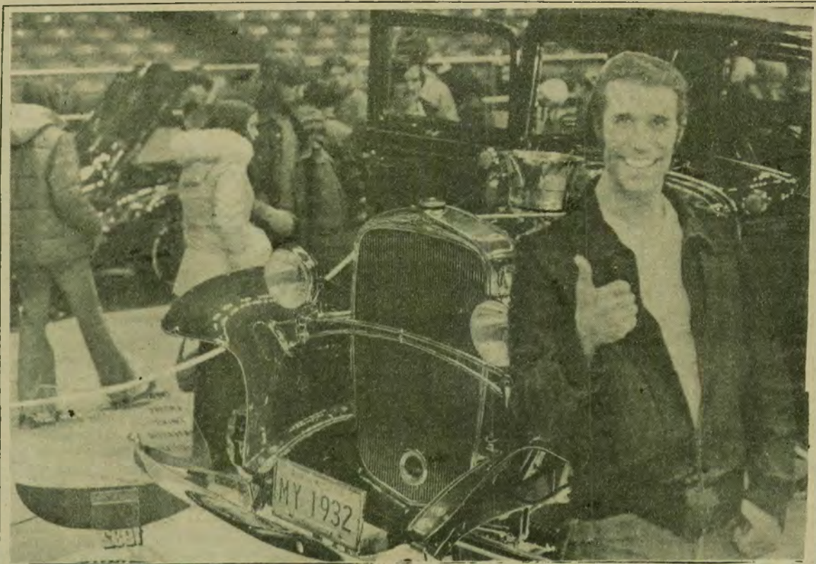
This is one of the many unique cars on display at the 'Cavalcade on Wheels' this past weekend at the ACC.