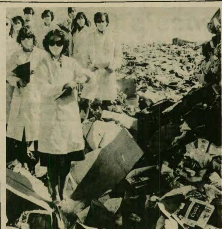
DOCTORS OF GARBAGEOLOGY. Archeology students at the University of Arizona tiptoe through mounds of Tuscon trash to hone skills usually used for studying remnants of ancient civilizations.