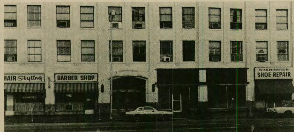
A great deal of controversy surrounds the Odd Fellows Building.

Section three is part of a city block containing the main terminal for the South Bend Public Transportation Corporation and the Odd Fellows Building, a structure which primarily contains offices for professionals.