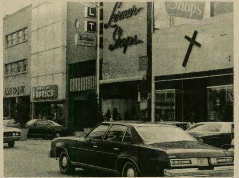
Under the new mall proposal, all these stores are due to be razed.

On August 16 the Area Planning Committee passed a unanimous resolution which also approved the addition and purchase of additional