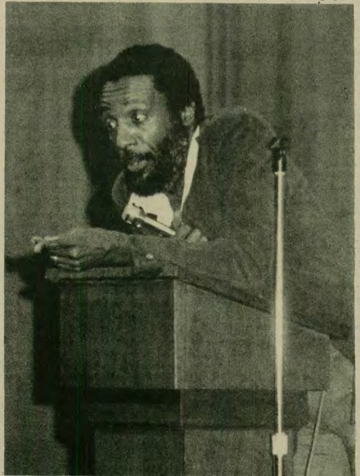
Dick Gregory, comedian turned human rights activist surprised a capacity crowd in the Library Auditorium with a number of revealing allegations.

Scheduled to begin at 7:30, Gregory arrived at 8:45, owing his [continued on page 4]