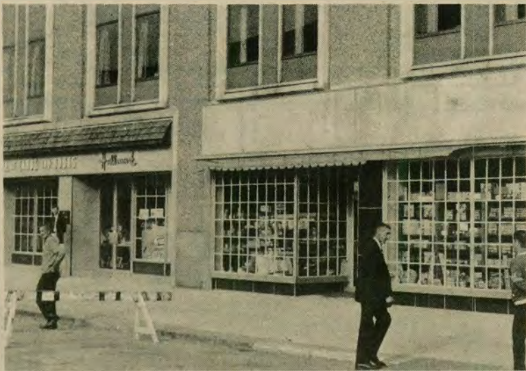
The Sherland Building

Doyle feels that the proposed mall would never pass if put to a referendum. Until the public hearing on October 7, though, no further action can be taken.