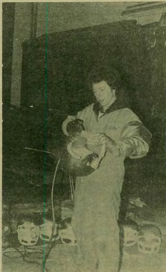
that this tradition is upheld every week. These dedicated students make sure that every game helmet receives four full coats of fresh gold paint to insure that the gold will be gleaming for kickoff time every Saturday.