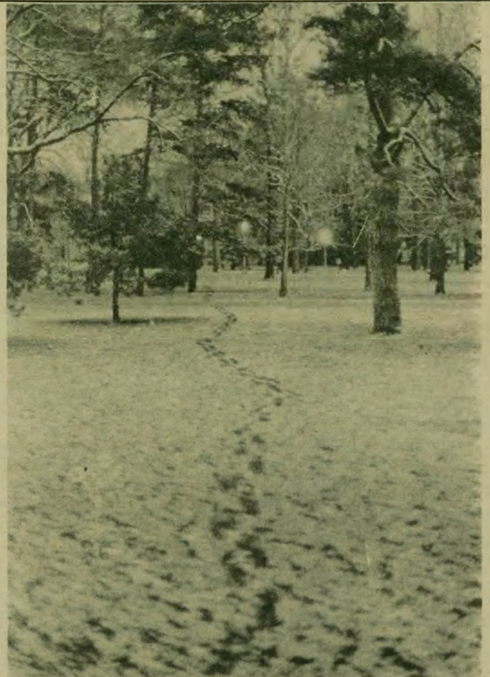
This student, panick-stricken and confused by South Bend's first snowfall, ran north for shelter. Maybe for the warmth of the grotto?.

Any student with further suggestions for improved security should call the Ombudsman (6283).