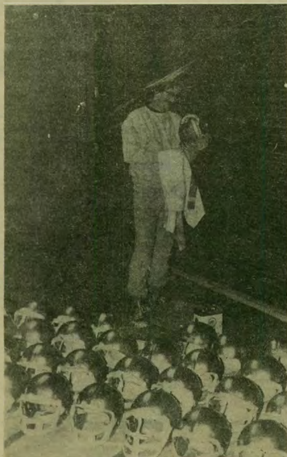
Although the 1977 version of the Notre Dame football team has become well known due to their wearin' of the green, the brilliant gold helmets have always been a symbol of the Irish gridgers. The Notre Dame student managers guarantee