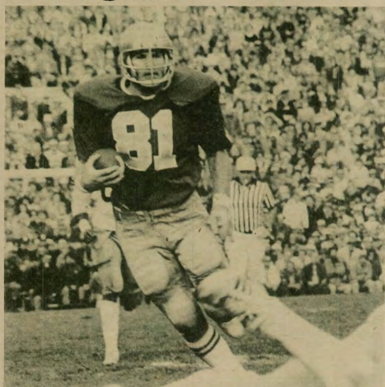
Irish tightend Ken MacAfee may be receiving an abundance of Joe Montana passes when the Irish tackle the Clemson Tigers.