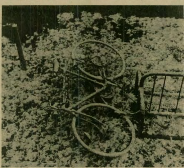
Use me, chain me, but don't leave me out in the snow! [Photo by Ken McAlpine].

"We hope this drive will be successful because materials are needed badly to insure employment during our slowest months. The girls are very enthused and ready to go to work on Nov. 12 for the handicapped," Russell concluded.