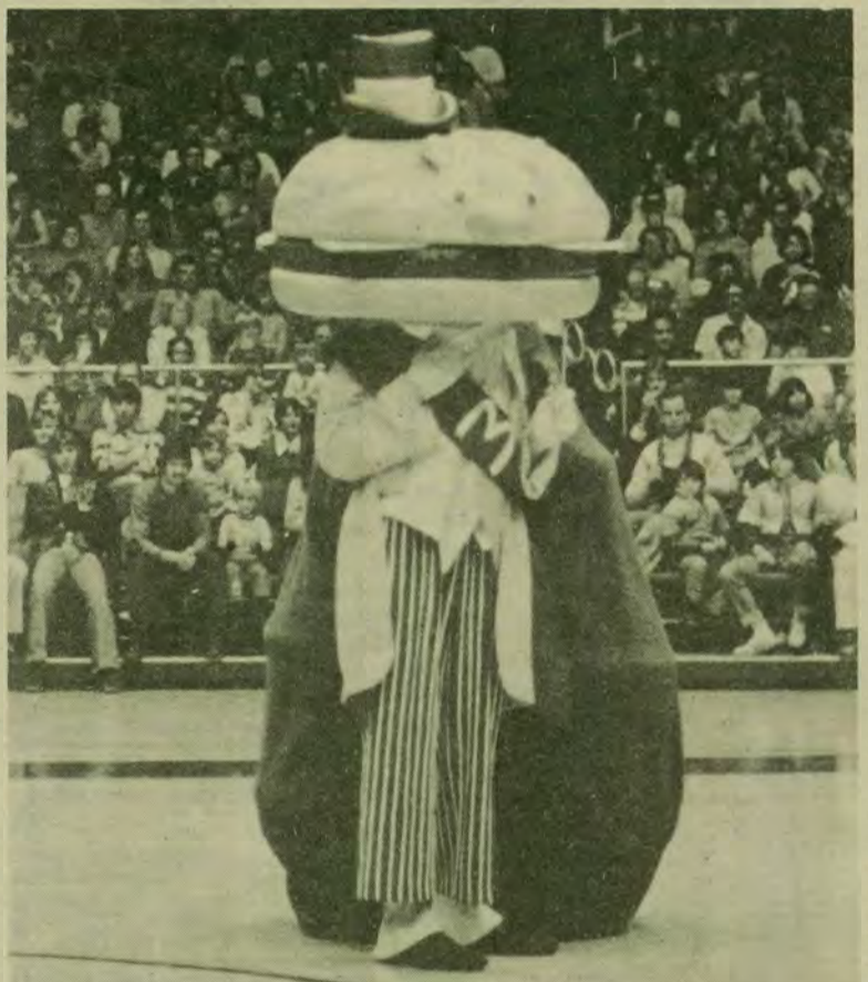
Mayor McCheese captained the McDonaldland basketball team as they performed for a full house before the intrasquad scrimmage last night in the ACC.