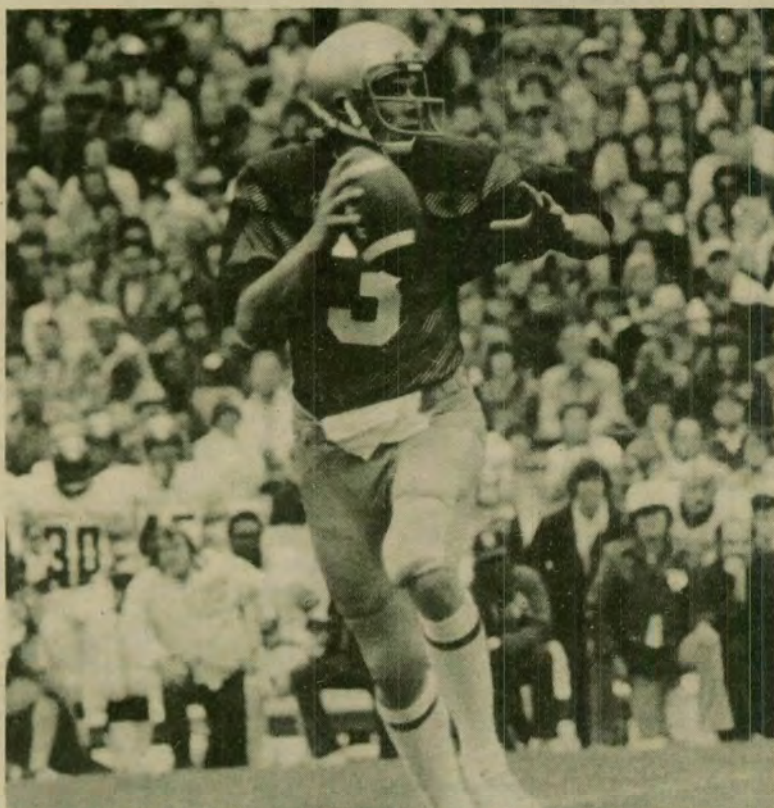
Joe Montana directed the Notre Dame offense to two fourth period touchdowns as the Irish overcame the Clemson Tigers, 21-17.