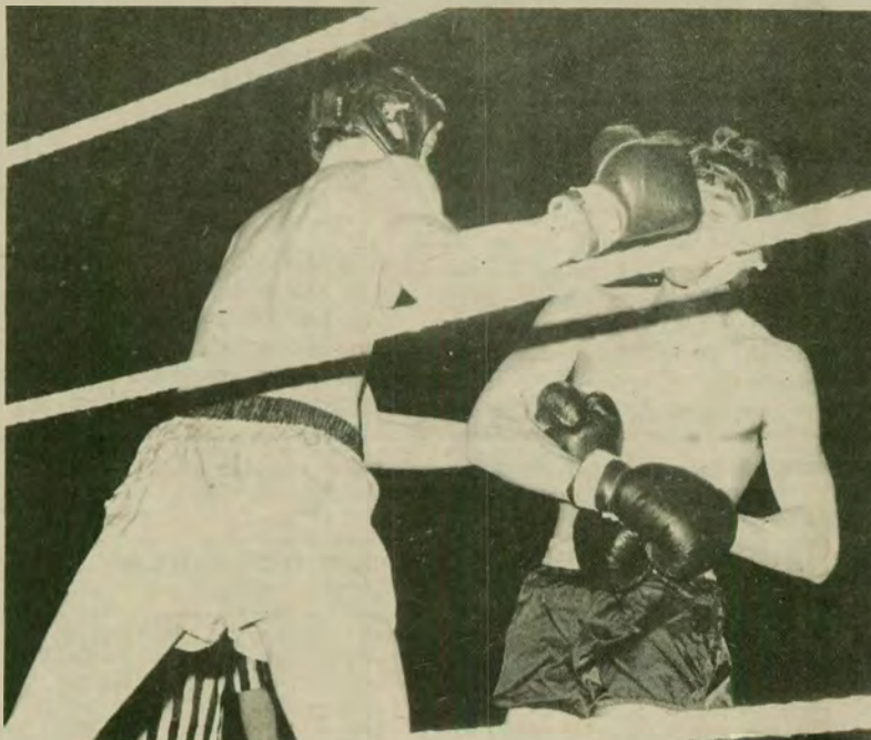
The 47th annual Bengal Bouts continued last night with 26 fights ending mostly in split decisions, while only a few technical knockouts.

A time for predictions? I see a final four of Indiana, Marquette, UCLA and Louisville although Arkansas or San Francisco could surprise. I'll have trivia column answers next week.