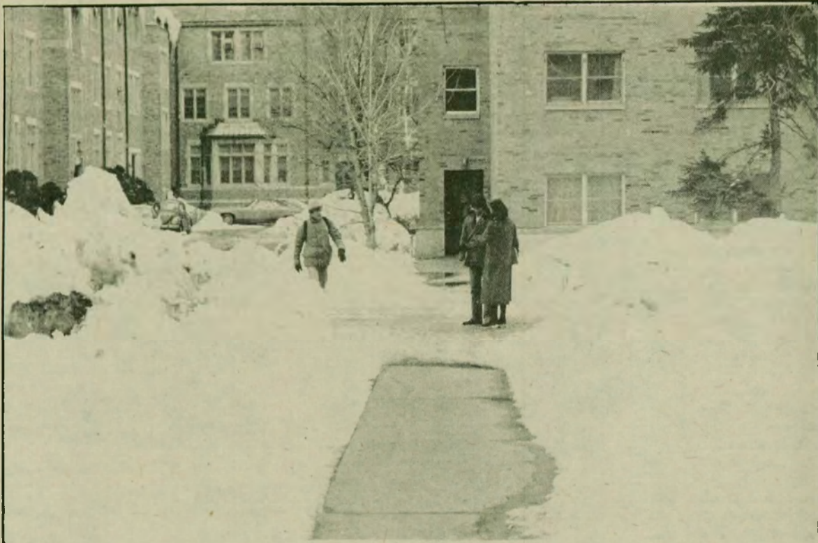
Visible sidewalks and melting snow--perhaps spring may someday be here!