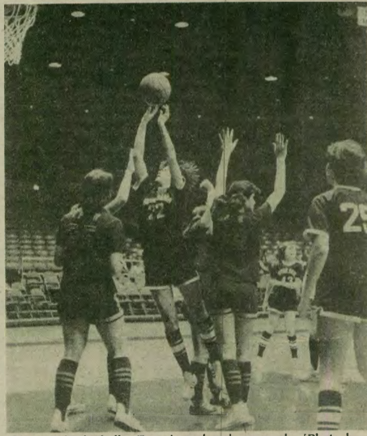
Women's basketball: Experienced and prepared.