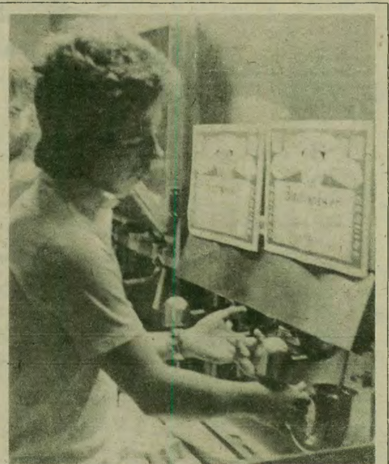
In the belief that their favorite beverage was finally being served at the South Dining Hall students were disappointed to find instead cold boring milk.