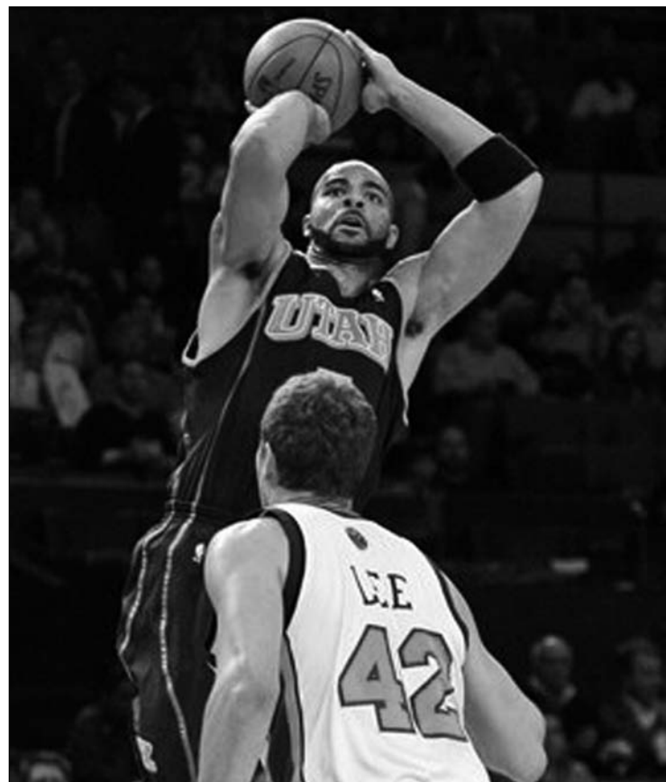
Jazz forward Carlos Boozer shoots over Knicks forward David Lee during the first half of Utah's 95-93 win over New York Monday.