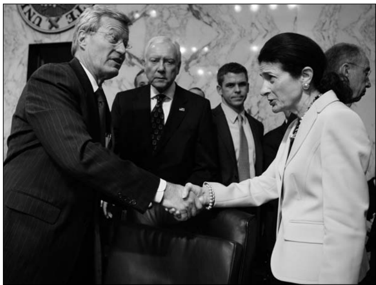
Senate Finance Committee Chairman Sen. Max Baucus, D-Mont., left, shakes hands with Committee member Sen. Olympia Snowe, R-Maine.