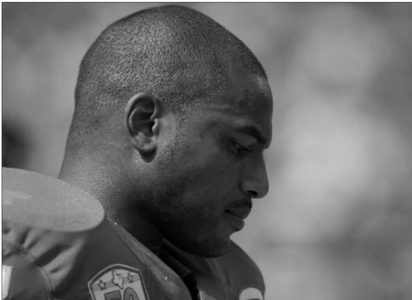
The Kansas City Chiefs released running back Larry Johnson Monday. Johnson was released after a series of off-the-field incidents, the latest coming two weeks ago.