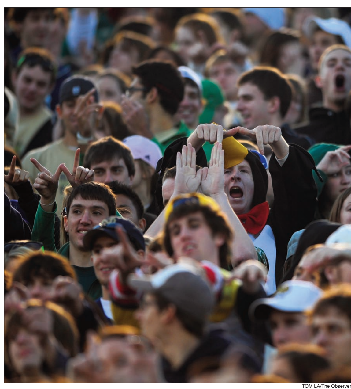
Students perform their own variations of the salute to the coach during the '1812 Overture' in between the third and fourth quarter of Notre Dame's 33-30 overtime loss to Connecticut.