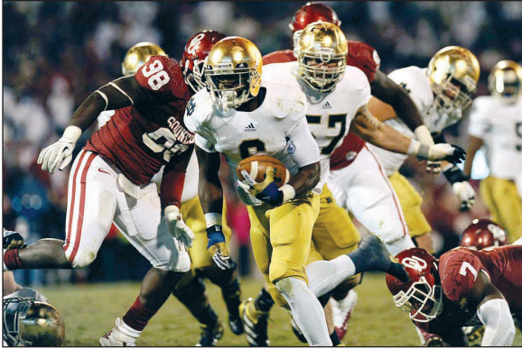
SUZANNA PRATT | The Observer