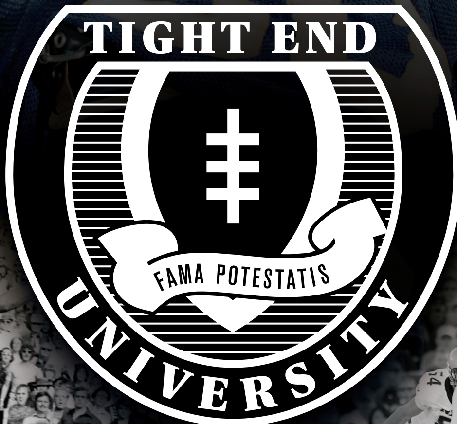
« MARK BAVARO »