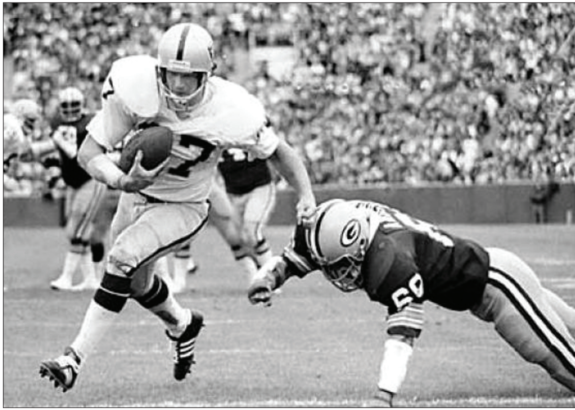
Former Irish tight end Dave Casper, left, played 11 season in the NFL — eight with the Oakland Raiders — and amassed 378 catches for 5,216 yards and 52 touchdowns.