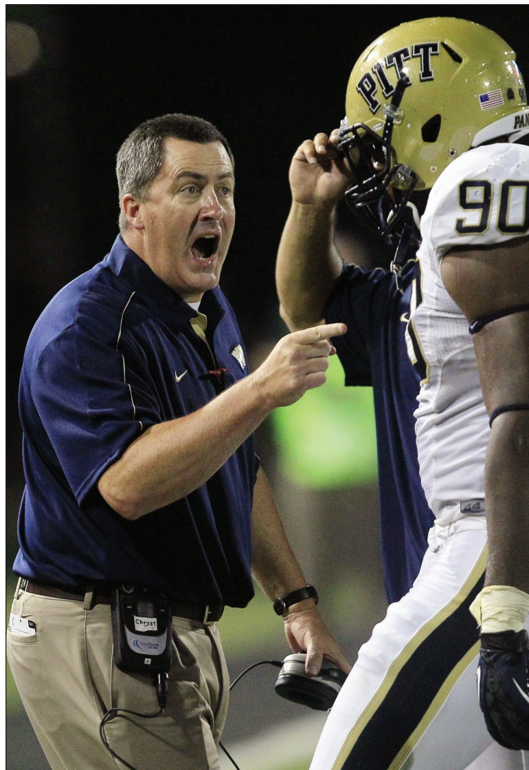
Panthers coach Paul Chryst, shown coaching during a game against Cincinnati, is Pittsburgh's fourth coach since 2010.