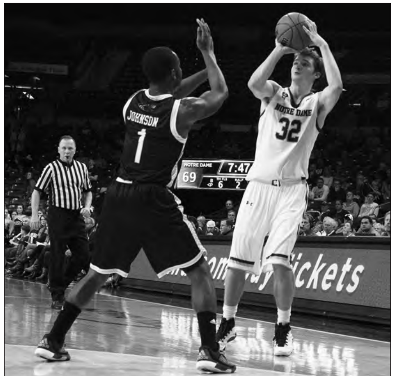
KATHRYNE ROBINSON | The Observer