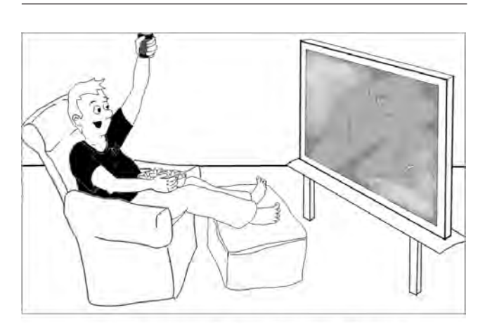
I exercise vicariously every Saturday afternoon.