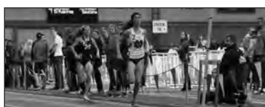
TRACK AND FIELD PAGE 12