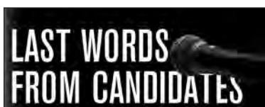
VIEWPOINT PAGE 6