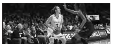
WOMEN'S BASKETBALL PAGE 12