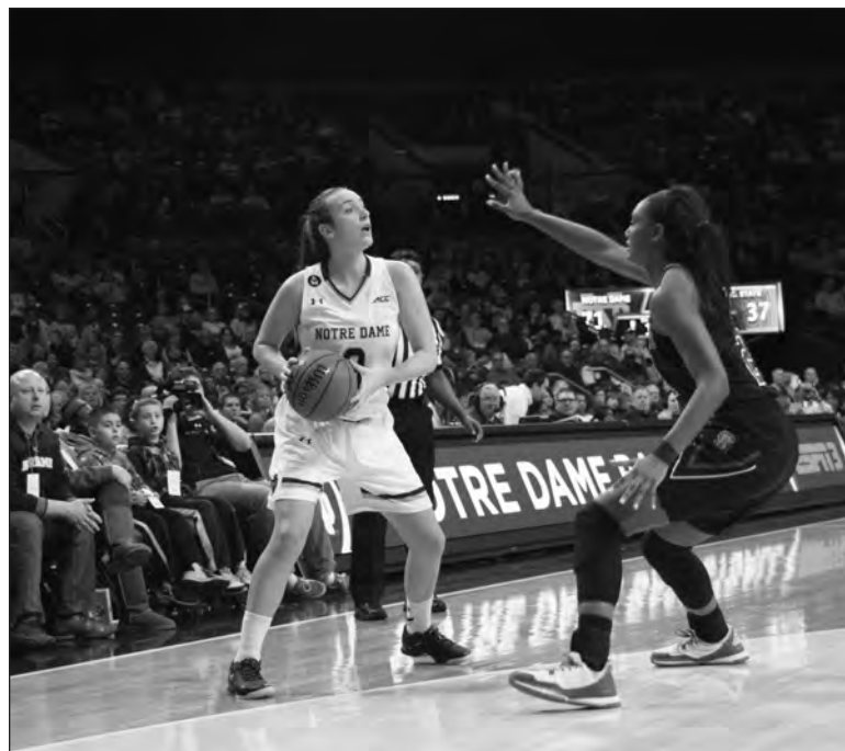
CAITLYN JORDAN | The Observer

The views expressed in this column are those of the author and not necessarily those of The Observer.