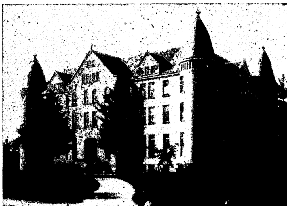
(IN FRONT OF THE CHURCH)