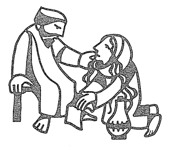
Her many sins are forgiven because of her great love

Confession used to be an opportunity to air the 'shopping list' of sins which I had accumulated. remember the anxiety was at its peak as I stood in line waiting to enter the dark, cold con-Then the omniscient fessional. spoke through the black screen. Sometimes I was so relieved that I emerged from confessional alive that Т was unable to feel the grace of the sacrament or to be aware of the soul feeling like a clean slate. I came to know God as a judge. I was quick to say prayers of penance.