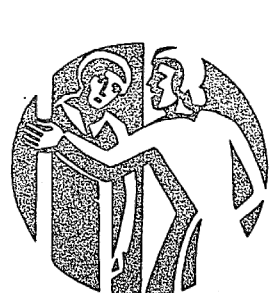
Giving shelter to stranger and homeless