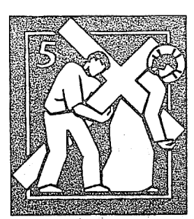
11.5 Simon of Cyrene carries the Cross - Matthew 27 323