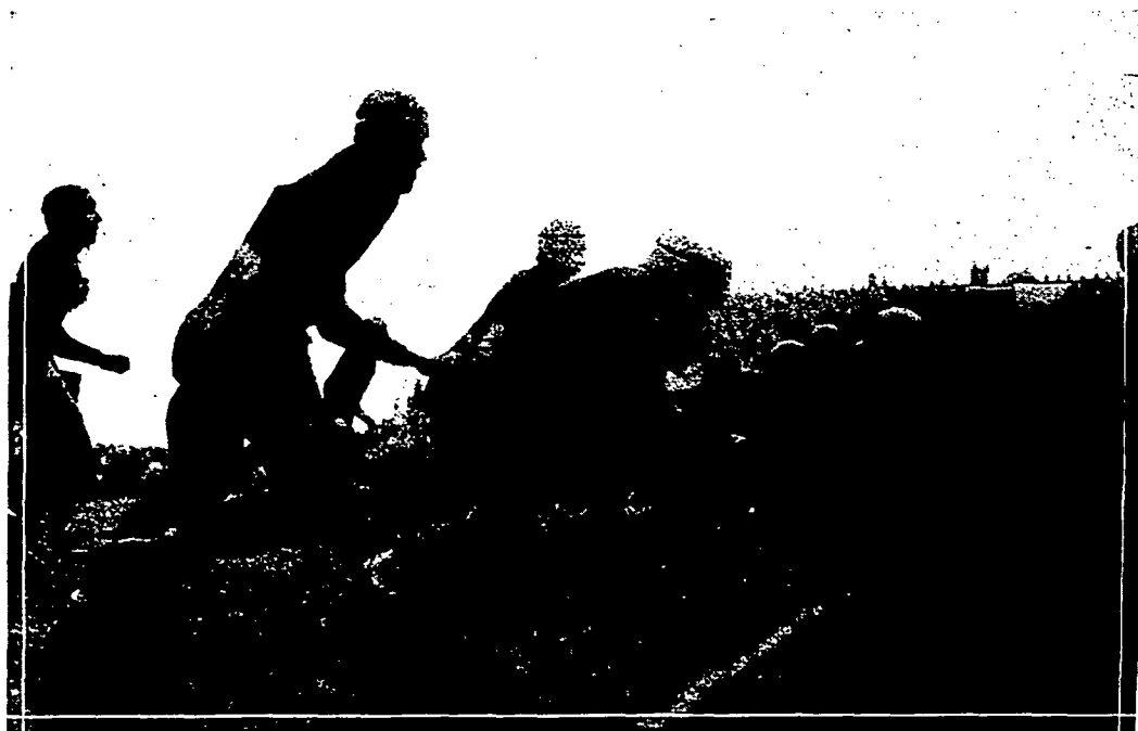
READY TO BREAK THROUGH THE "TECH" LINE

Beginning the last quarter Tech drew a five yard penalty. Their attack failing again, Wycoff punted out of bounds on