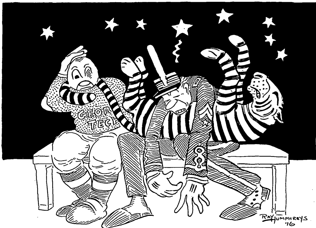
ASTRONOMY, REGINALD, JUST ASTRONOMY