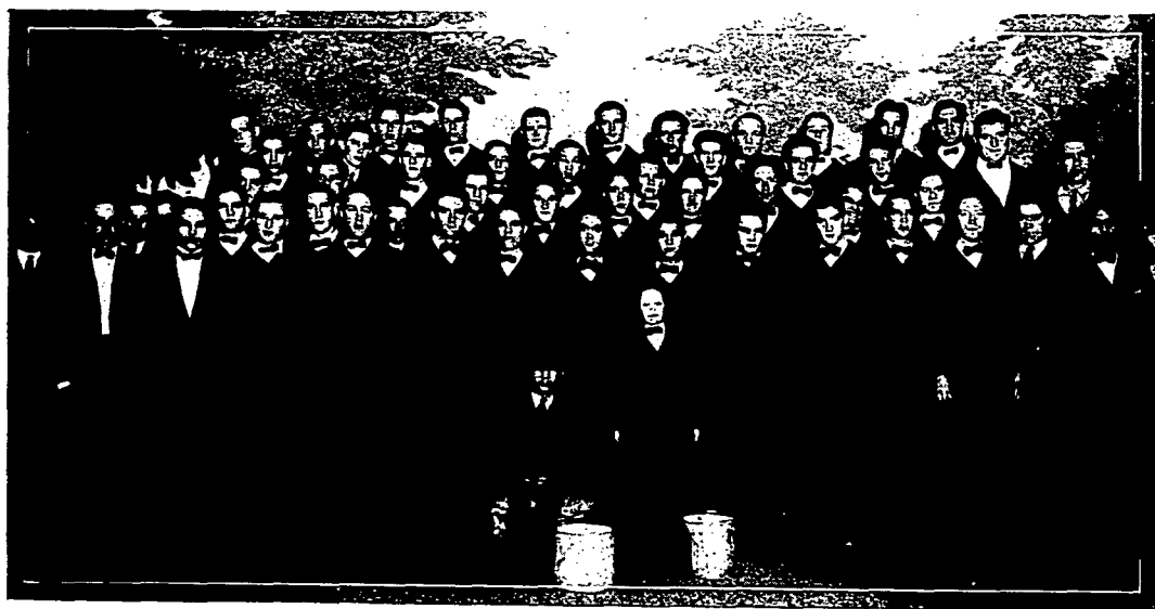
THE MONOGRAM ABSURDITIES GROUP