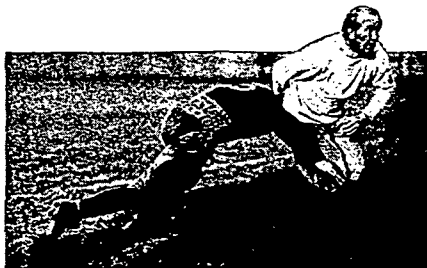
"At it Again"

As it is, the answer awaits the action and reaction of a goodly assortment of aspirants who went under the direction of the great Rockne on Cartier field this week. Of course, the real reply will be evident when the first game has been played; but gentlemen, we can right here and now state that the 1926 edition of the Rockne Ramblers will gratify that hope that springs eternal in the heart of the Notre Dame fan.