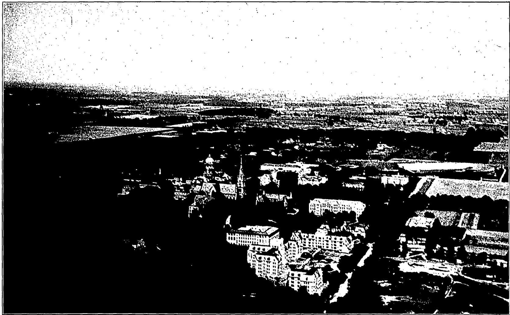
THE NOTRE DAME OF TODAY