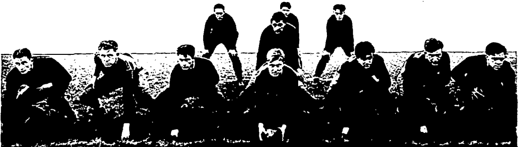
THE CHAMPION 1924 SQUAD.