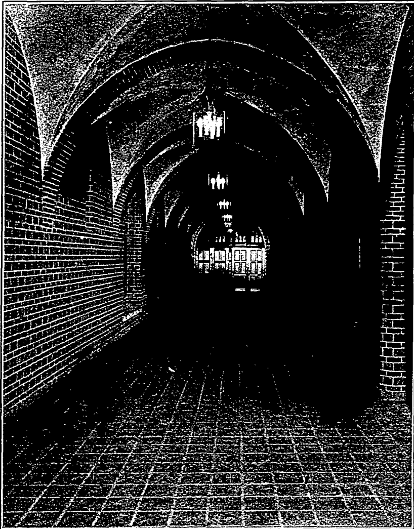
THE INTERIOR ENTRANCE HALL OF THE NEW DINING HALL