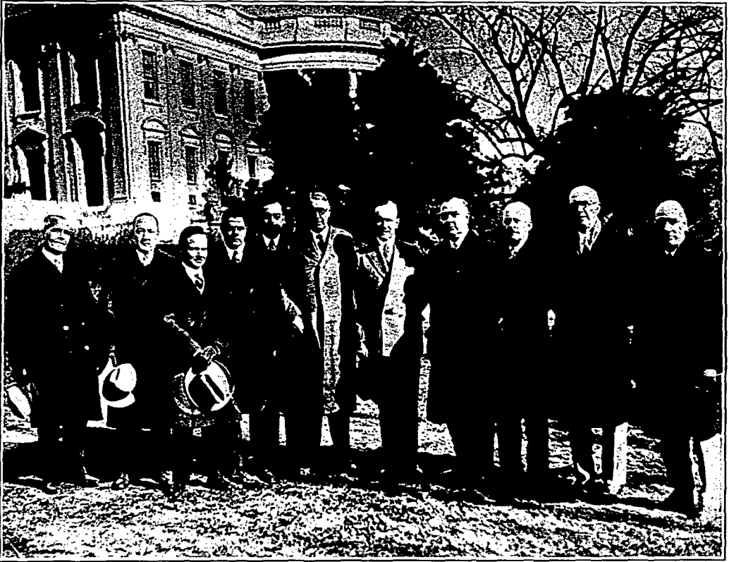
WITH OUR PRESIDENTS

NOTE: The writer of the article worked his way through Notre Dame, so he fully understands the poor boy's problem. This explanation is given so that there will be no misunderstanding in reference to the statements regarding the leaving of funds for the assistance of poor boys.