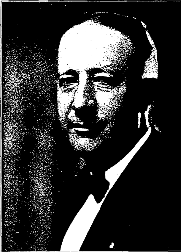
HON. ALFRED E. SMITH

worthy activities of life or division of knowledge, as well as distinguished service to our country in public life, are among the reasons determining the selection and bestowal of this honor. The long and honorable public career of ex-governor Alfred E. Smith, as well as the fine example of his private family life, are known and admired by the entire American people. These public and private virtues are inseparable