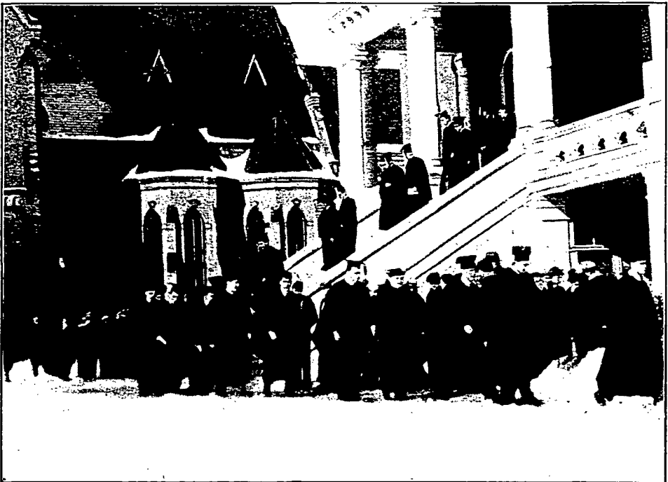
SENIORS MARCHING TO WASHINGTON HALL