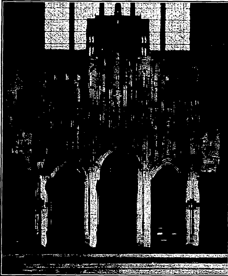
Interior of Chapel, University of Chicago. Bertram G. Goodhue Associates, Architects. The exterior of this magnificent new building is also of Indiana Limestone.