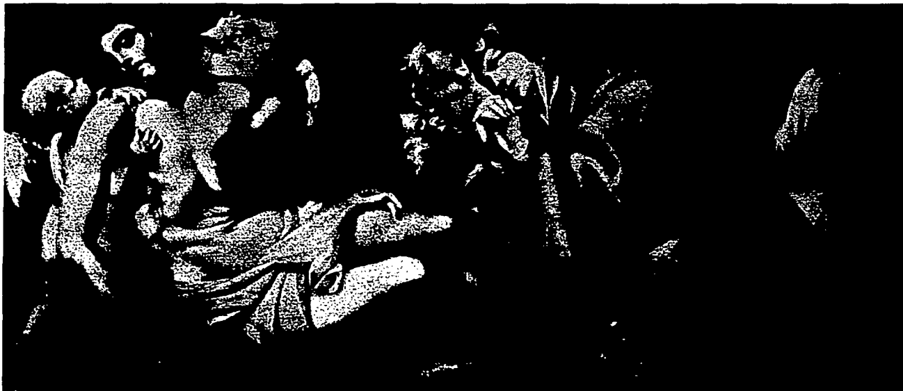
The "Deposition" of Fra Bartolomeo, in the University Galleries.