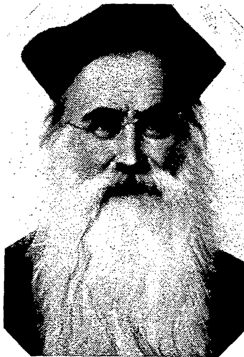
Rev. Edward Sorin, C.S.C. 1842-65