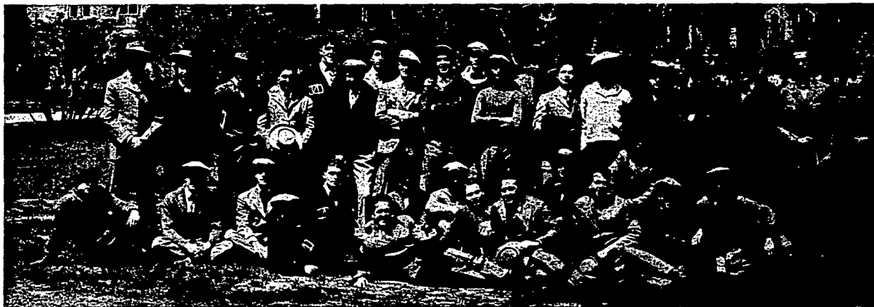
The campus days of 30 years ago came to life as student extras, costumed by Warner Brothers, were employed for Rockne picture scenes.

Neither time nor place for the world premiere of the picture has been set as this is written, but early October and South Bend seem to get the most votes in varied discussions.