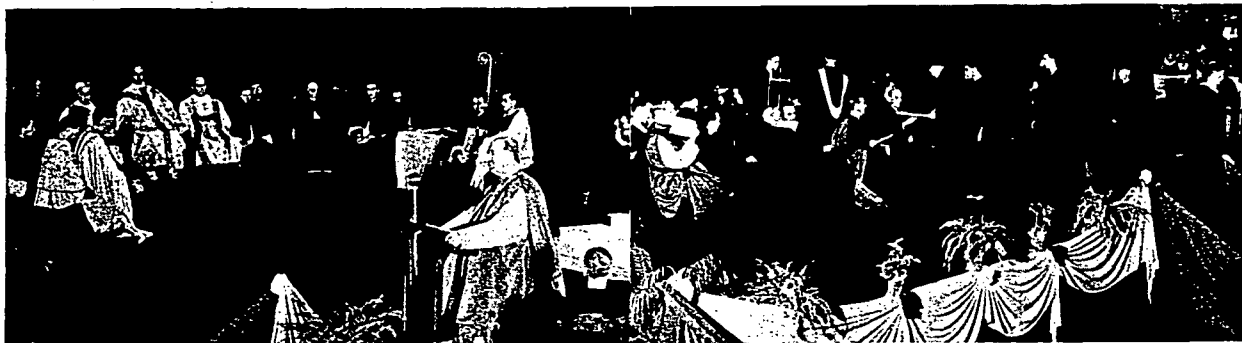
Archbishop Cantwell Preaches; Bishop O'Hara Pontificates at Baccalaureate Mass

The 15-Year Class of 1925 cracked some kind of a record by bringing back 85 registered members as against the