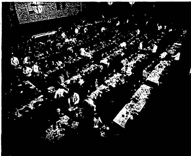
At the Alumni Banquet; 1,000 Crowd Dining Hall to Hear Great Program of Speeches