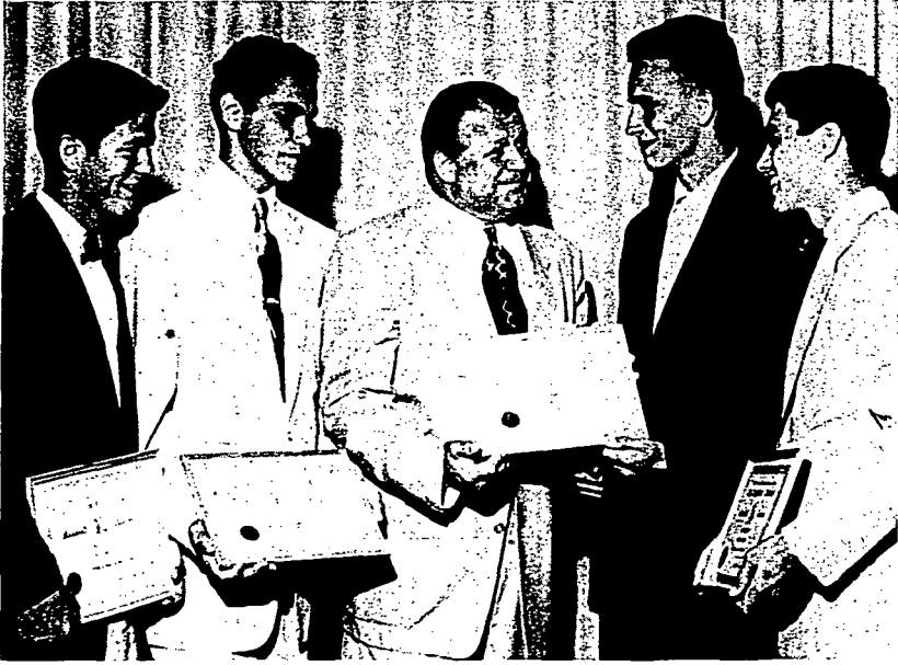
Baseball star Jimmy Foxx poses with youngsters who received certificates as members of the All-Florida Catholic High School nine. Winners were selected by the Notre Dame Club of Greater Miami.