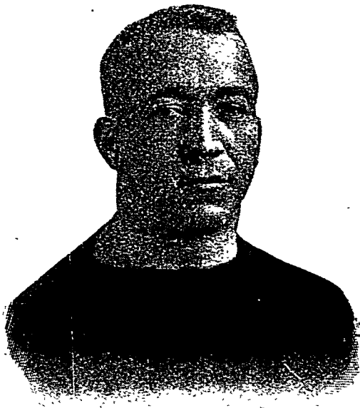
KNUTE ROCKNE, ASST. COACH