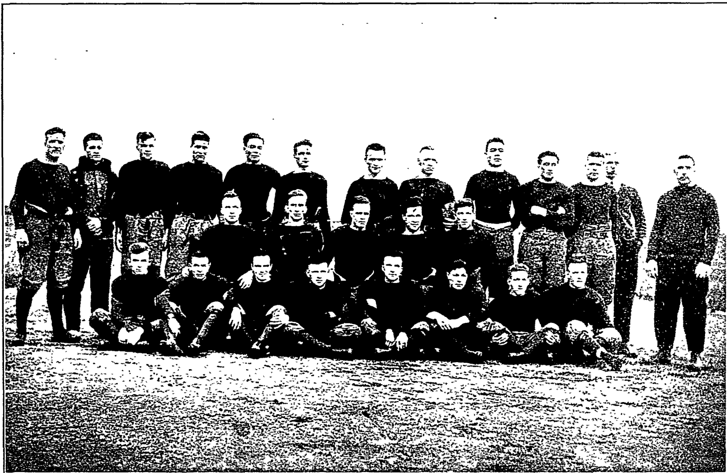
THE 1915 FRESHMAN SQUAD.