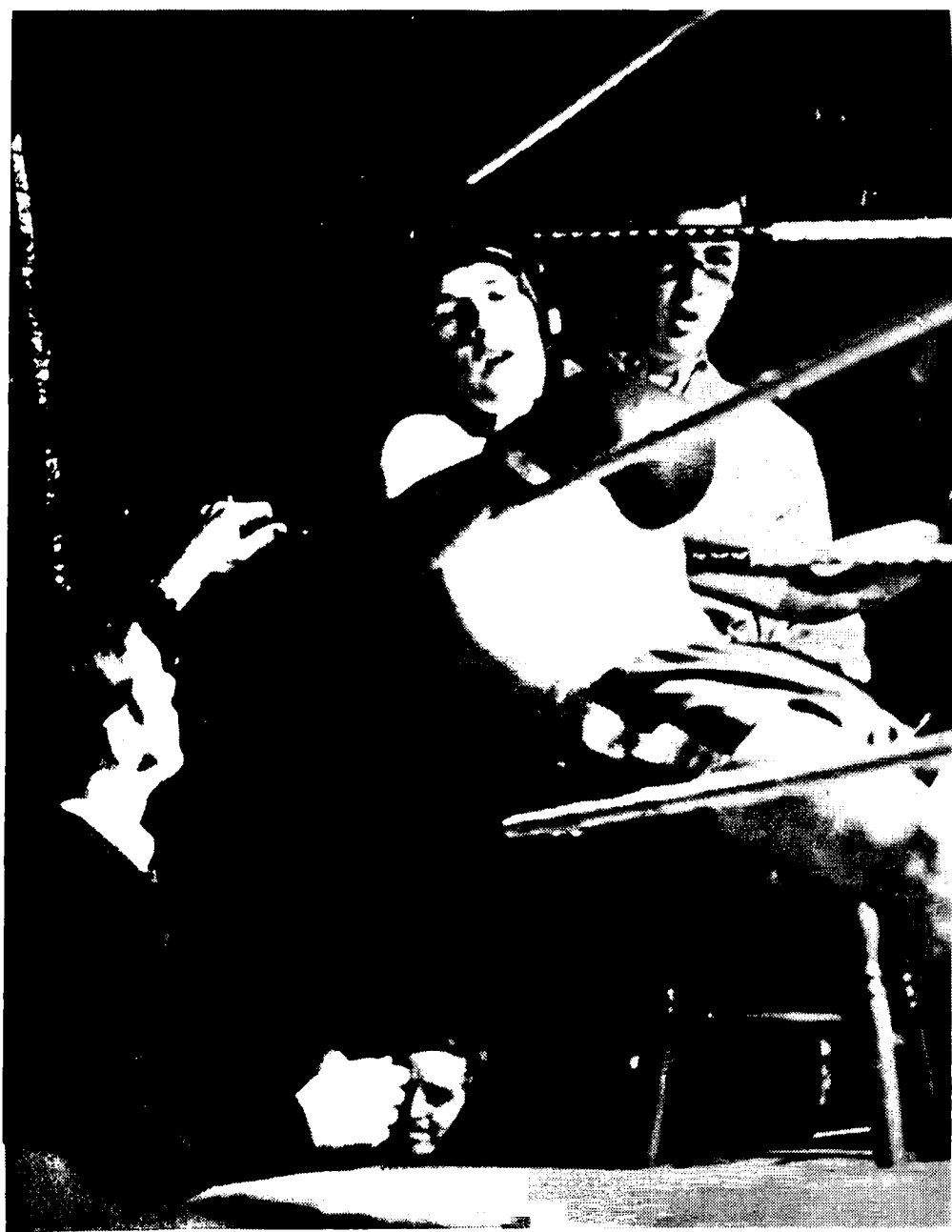
Action at Tuesday's Bengal Bouts. Although the opening field of fifty-six hopefuls has now been narrowed down to twenty-two, local boxing buffs are unanimous in voicing their praise for the pugilistic prowess thus far exhibited in the Ring by both the victors and the vanquished. Tonight the champs meet the champs with gloves on in the Fieldhouse in the 1968 final matches.