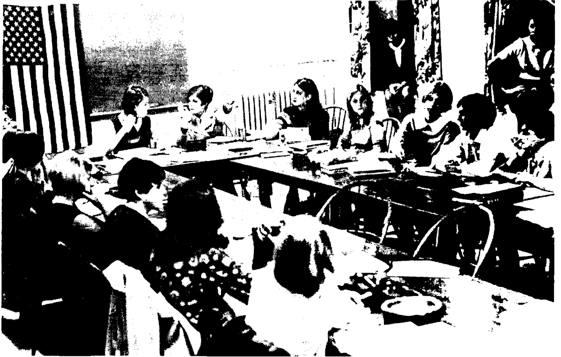
SMC Campus Legislature abolished sign-out and self in meeting last night.