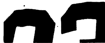
Ex-Irish Pro: No. 8