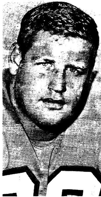
Ex-Irish Pro: No. 7