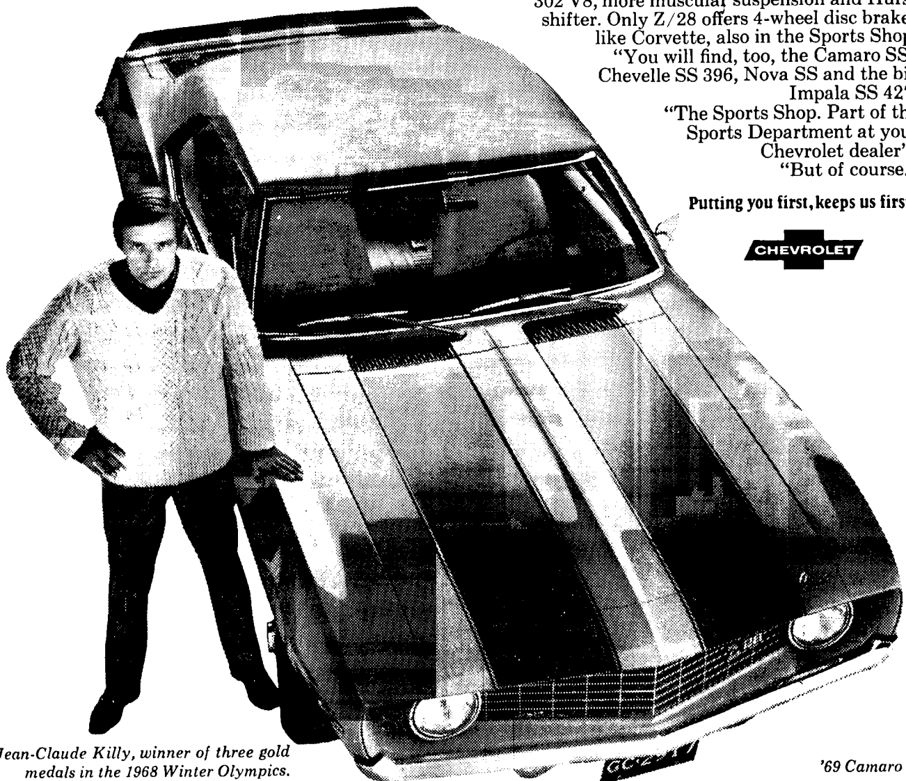
Jean-Claude Killy, winner of three gold medals in the 1968 Winter Olympics.