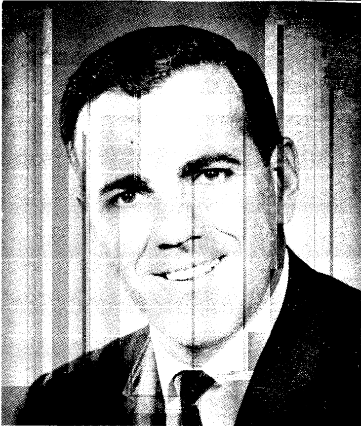
Record-setting coach Ara Parseghian