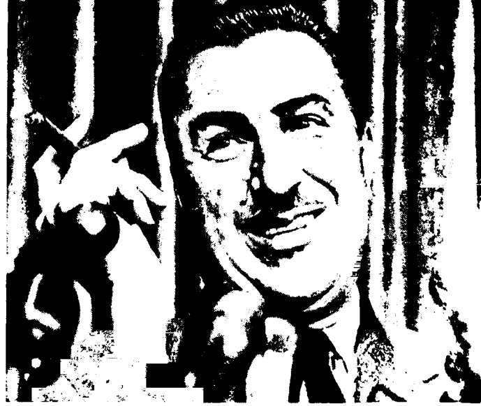
Congressman Adam Clayton Powell

The Congressman also advocated an unlimited "divine" right of dissent, but with the reservation that violence should not be implemented "until you reach a breaking point beyond all reason."